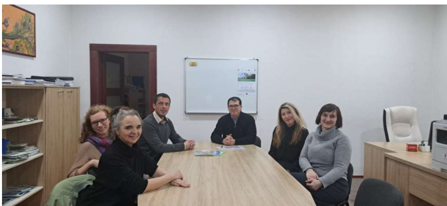
Photo 2_ NONA On-site visit, Trg Zlatnih Ljiljana, February 2025