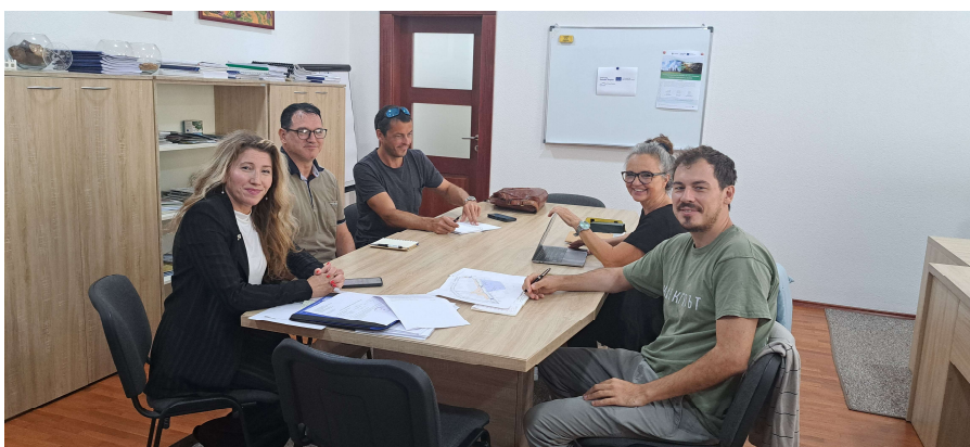
Photo 4_ NONA Academy Coordination Meeting, July 2025