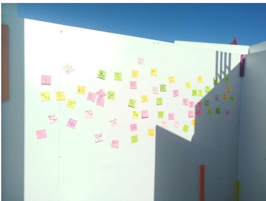
Photo 7_ Student comments during the NONA Academy in Cazin, July 2025