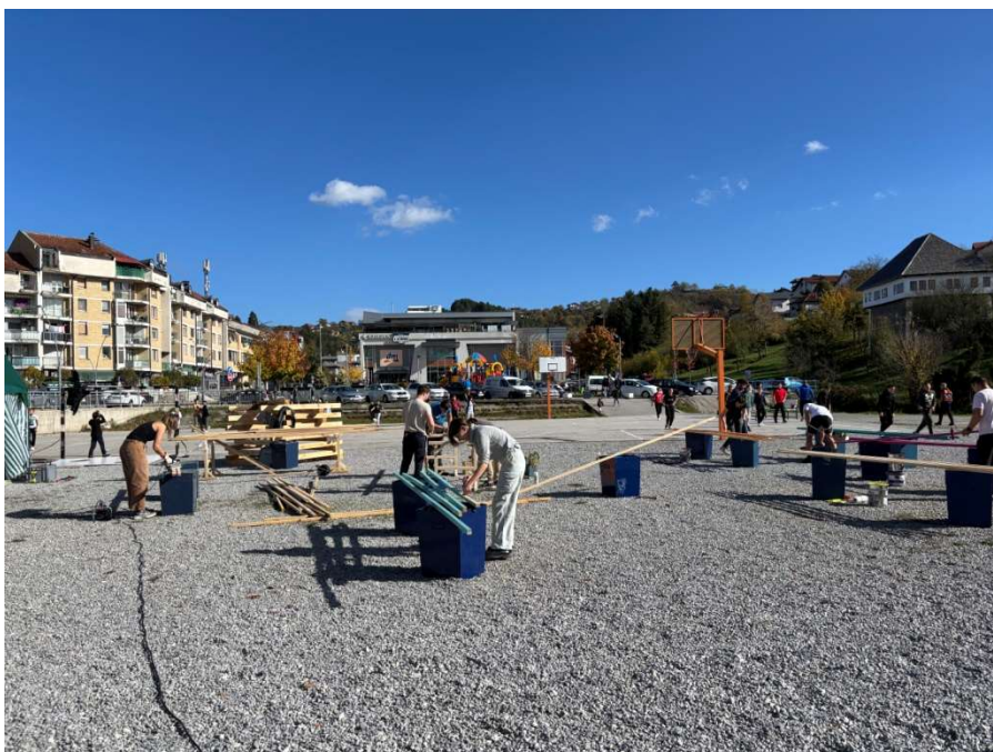
Photo 5_ International participants and local stakeholders of the NONA Academy in Cazin, July 2025