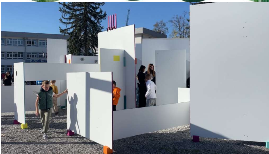
Photo 6_ Students and teachers of Cazin I Primary School actively participating in the NONA Academy in Cazin, July 2025