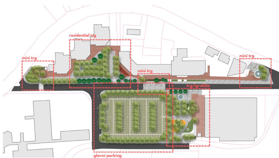
Photo 8_ Conceptual solution for the reconstruction of Trg Zlatnih Ljiljana, May 2026