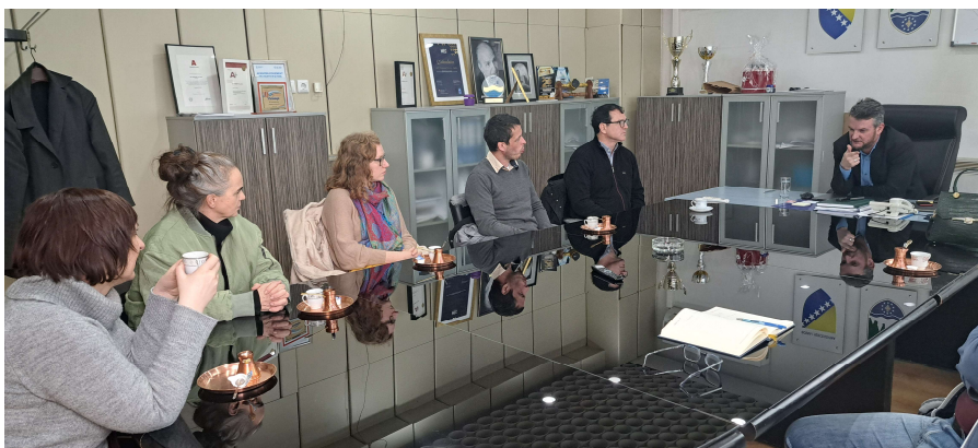
Photo 3_ Meeting with the Public Utility Company "Vodovod" February 2025